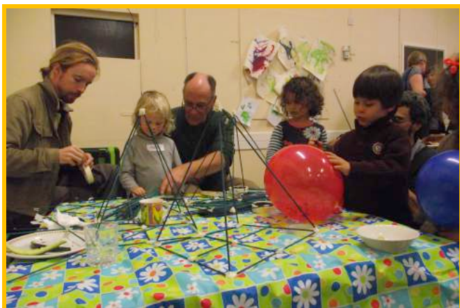
Learning how to make lanterns.