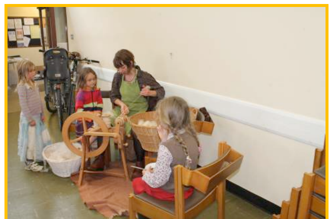
Playing with the spinning wheel.