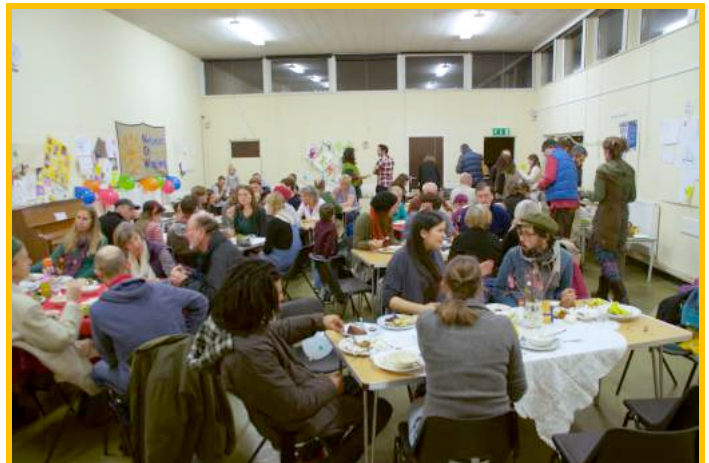
Feast and buzz at the Totnes Community Potlucks, in the UK.