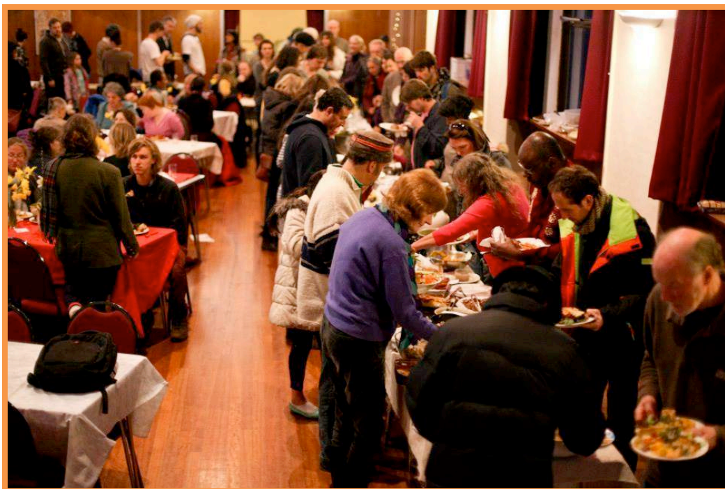
Members of the community enjoy the feast.

In addition to general evaluation, it's essential to show how the event went if your event was funded, so you can report back to those who provided financial support. Your funders may have specific things they want you to report on, so make sure you've recorded them and send them back in good time.