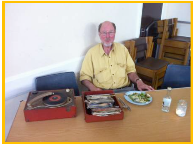
Lovely music offered by a member of the community.