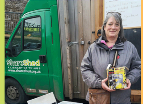
Share Shed Members