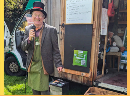
WoolFest Buckfastleigh 2024