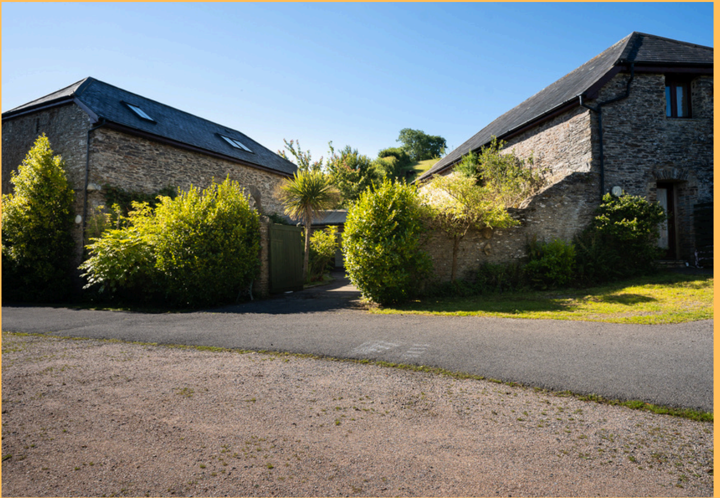
Eden Rise - a haven for wellbeing