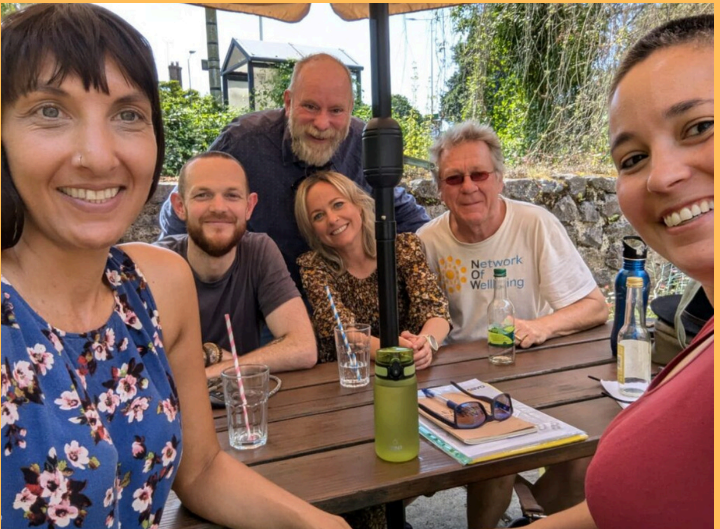
Network of Wellbeing's staff - June.2024